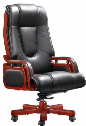
Annexure No. 5