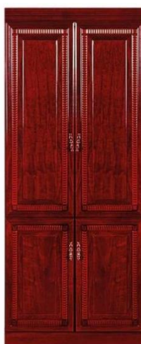
Annexure No. 4