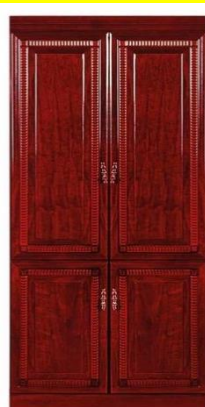
Annexure No. 4