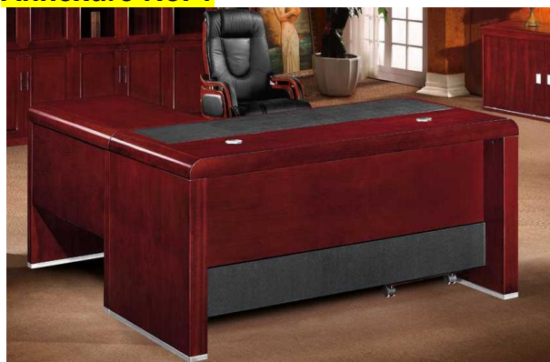
Annexure No. 1