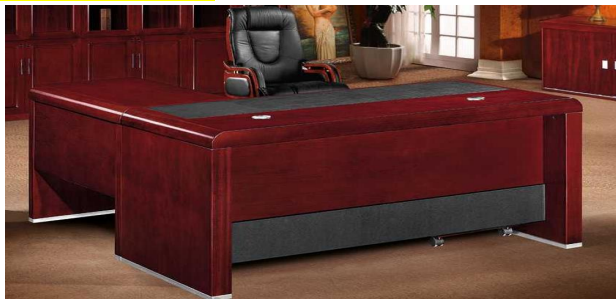
Annexure No. 1