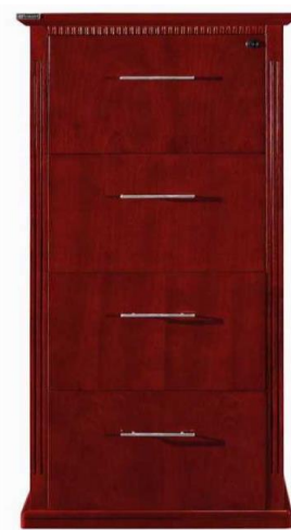
Annexure No. 5