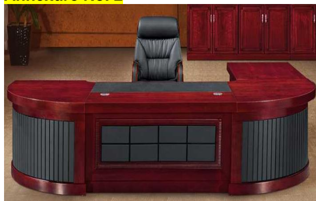
Annexure No. 2