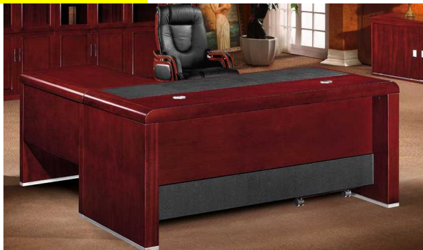
Annexure No. 1