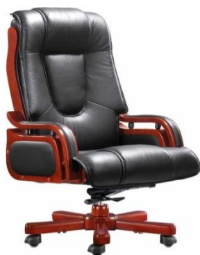
Annexure No. 6