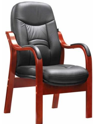
Annexure No. 9