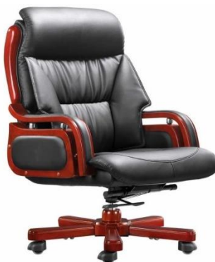
Annexure No. 7