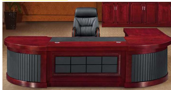
Annexure No. 2