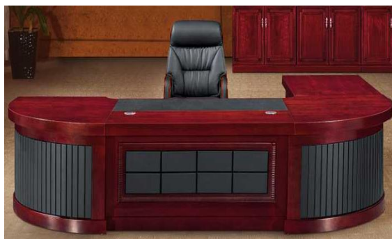
Annexure No. 2