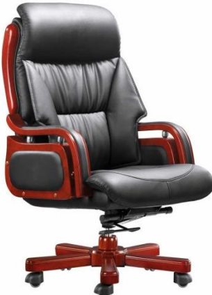
Annexure No. 6