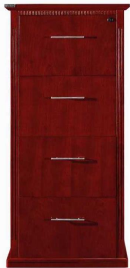
Annexure No. 4