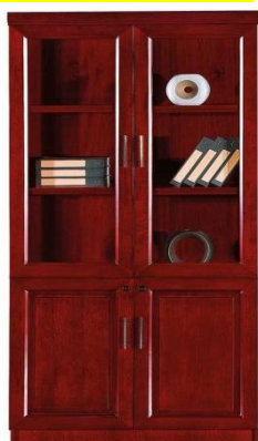
Annexure No. 3