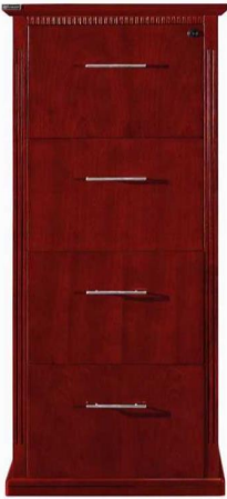
Annexure No. 6