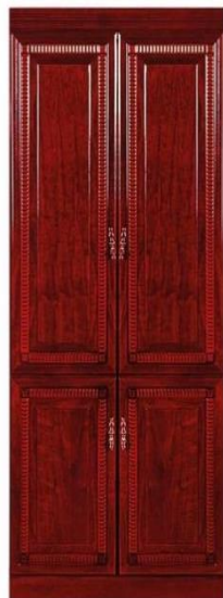
Annexure No. 3