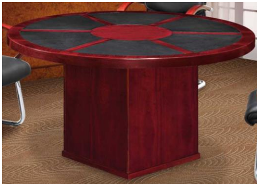
Annexure No. 10